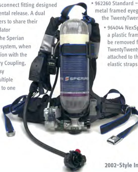
2002-Style Industrial Panther