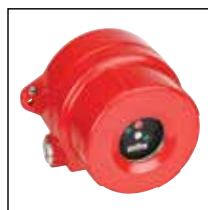
Multi-Spectrum QuadBand Triple IR Flame Detectors