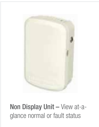
Non Display Unit – View at-a-glance normal or fault status

USB Port – Update display graphics with logo and contact information; allow future uploads of product enhancements