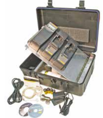
MicroDock II portable system kit