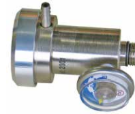
Demand flow regulator