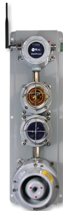
RAEPoint Wireless Alarm Bar