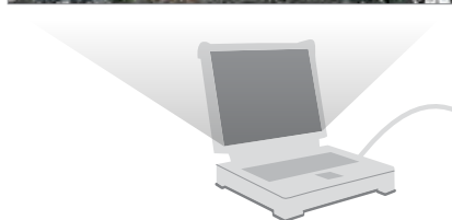
RAE Link3 2.4 GHz Host