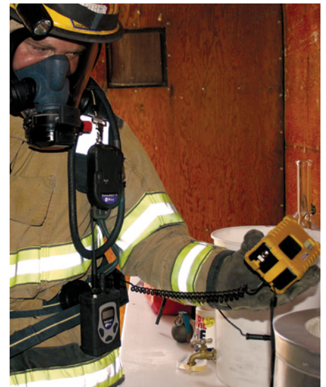
Hazardous Material Response Team member using MultiRAE Plus and GammaRAE II R with RAELink3 Z1