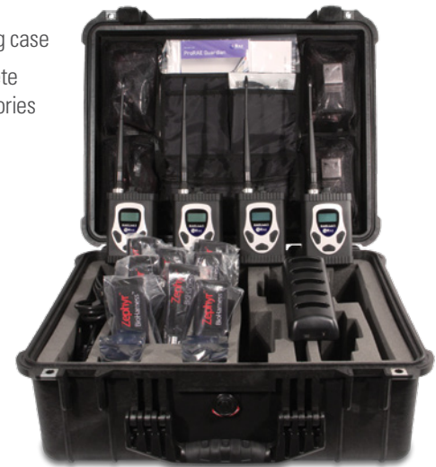
BioHarness Team Kit

BioHarness is a trademark of Zephyr Technology