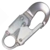
Aluminum Snap Hook 3/4 in. (19.1 mm) Gate Opening