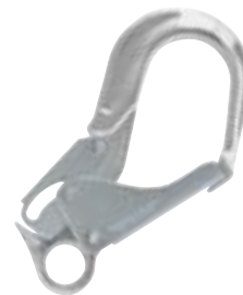
Aluminum Rebar Hook 2 1/2 in. (63.5 mm) Gate Opening