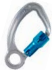
Aluminum Captive-eye Carabiner 0.86 in. (22 mm) Gate Opening