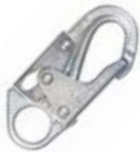
Steel Snap Hook 3/4 in. (19.1 mm) Gate Opening