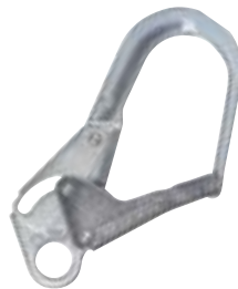
Steel Rebar Hook 2 1/2 in. (63.5 mm) Gate Opening