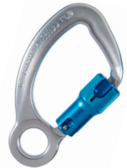
Aluminum Captive-eye Carabiner 0.86 in. (22 mm) Gate Opening