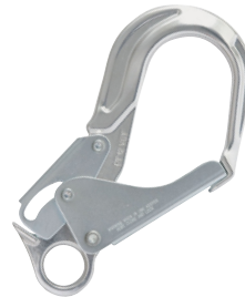
Aluminum Rebar Hook 2 1/2 in. (63.5 mm) Gate Opening