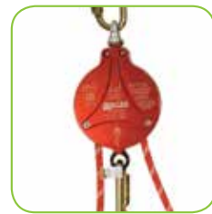
Backup Braking System included in Premium Kit

Best choice for users whose job does not normally include rescue