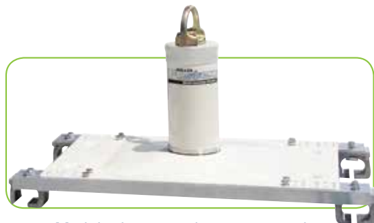
Modular bar extenders accommodate additional standing seam widths.

The easy-to-install Miller Fusion Roof Anchor Post is designed for quick set-up and does not require roof penetration to sub-surface rafters or trusses.