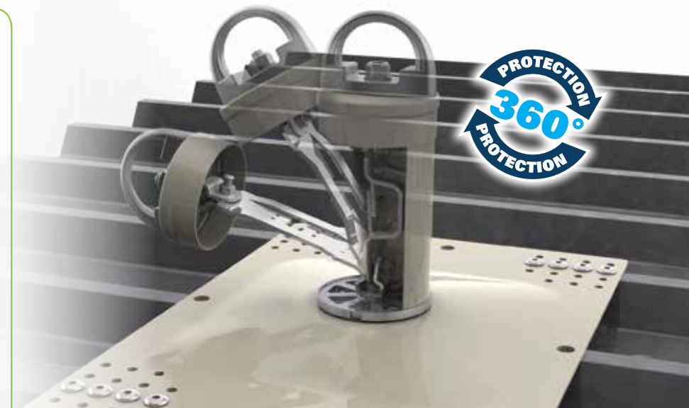
In the event of a fall, the Miller Fusion Roof Anchor Post orients in the direction of the force, the built-in, energy-absorbing component activates and the base remains securely attached to the roof surface.