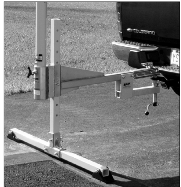
DH-16 attached to DH-12