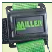
Self-contained label pack