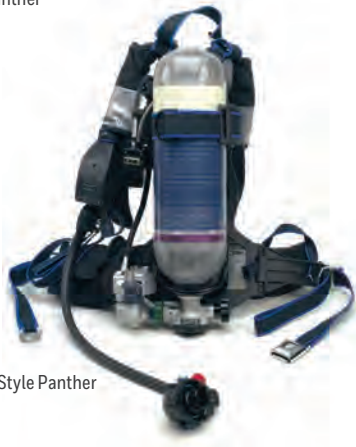
2002 Style Panther

To build your own SCBA to meet your unique worksite needs, visit the Honeywell SCBA Configurator at scaconfig.honeywellsafety.com .