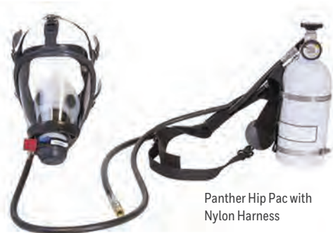
Panther Hip Pac with Nylon Harness