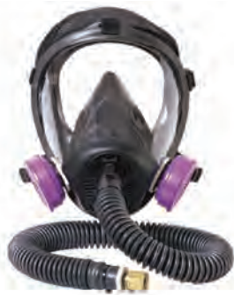
CF4002; facepiece not included