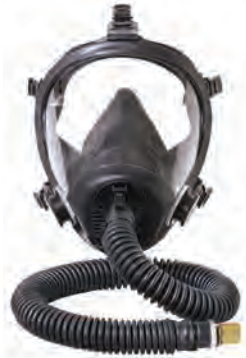
CF4001; facepiece not included