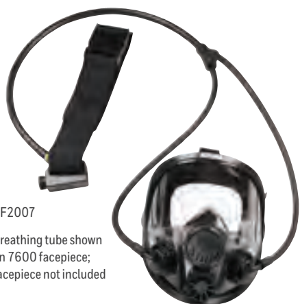
CF2007 Breathing tube shown on 7600 facepiece; facepiece not included