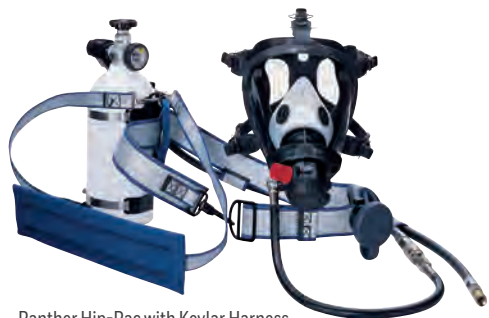
Panther Hip-Pac with Kevlar Harness