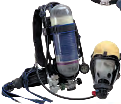
1997 Style Panther