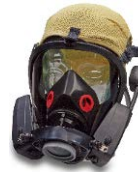
Facepiece with VAS and RCS