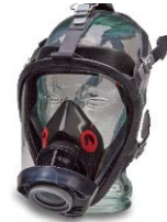
Facepiece with 5-Pt. Strap

See page 9 for additional facepiece sizes and facepiece part numbers with temple inserts.