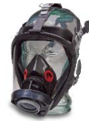
Facepiece with 5-Pt. Strap